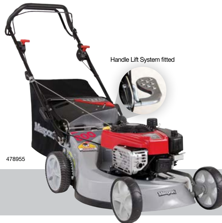
Handle Lift System fitted

*Drive speeds are an approximate measurement.