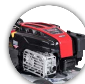
850 ENGINE WARRANTY*