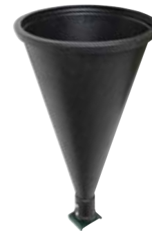
Optional grate (Part No. 929304)