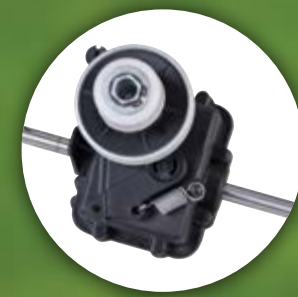
CONE CLUTCH 4002 TRANSMISSION

Variable speed, smooth start, aluminium lower housing for improved wear resistance.