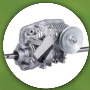
GT AGILITY PRO 3 SPEED COMMERCIAL TRANSMISSION

Progressive clutch low force required to maintain engagement. (Single speed gearbox pictured)