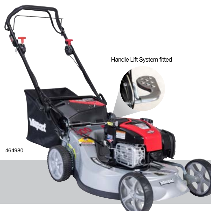
Handle Lift System fitted