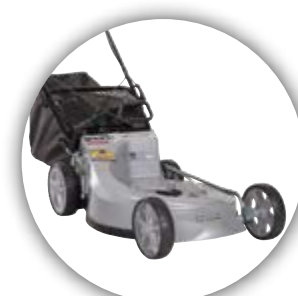
LIMITED PRODUCT WARRANTY*

Conditions apply. For full warranty conditions please refer to the Masport warranty card included with your mower.