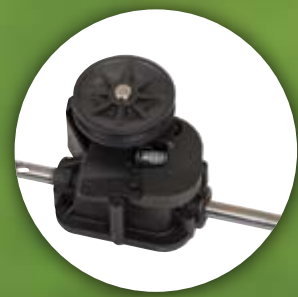
SYNCHRO CLUTCH TRANSMISSION

Let the mower do the work. These models are fitted with a self drive system. All you need to do is squeeze the self propelled bail to the handle to propel the mower forward.