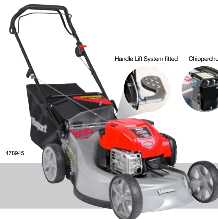
Handle Lift System fitted Chipperchute