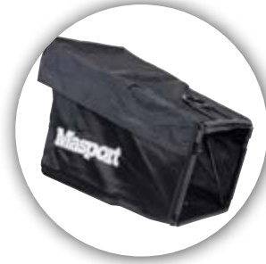
COMMERCIAL CATCHER for 21" cut width lawnmowers

A large and stylish combination plastic & fabric catcher which can hold 2 bushels of grass clippings. This catcher is well vented to provide superior catching performance.