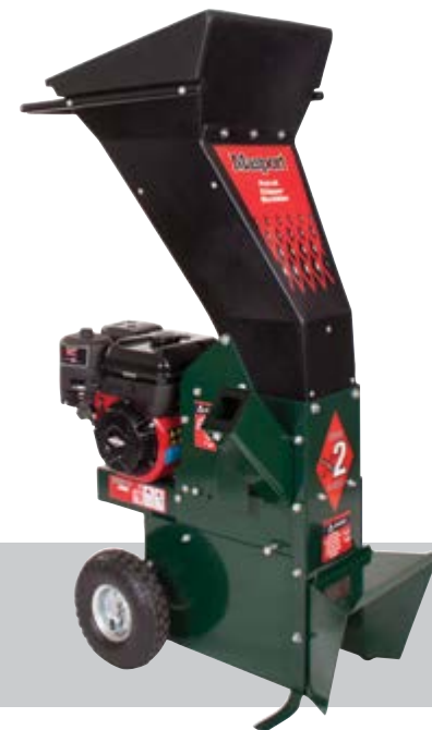
Optional Chipper side chute (Part No. 436937)