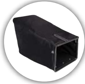
FABRIC CATCHER for 21" cut width lawnmowers

Light weight fabric catcher on a sturdy steel frame. Well vented for excellent catching performance. Will hold 1.2 bushels on 350ST machines.