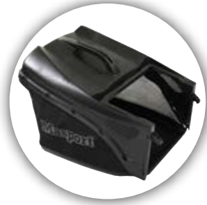
AERO CATCHER for 21" cut width lawnmowers

Large light weight fabric catcher on a sturdy steel frame. Well vented for excellent catching performance. Will hold 2 bushels.