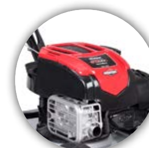
LIMITED ENGINE WARRANTY

* The Limited Product Warranty does not apply to the engine you receive with the mower.