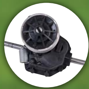
MC600 SEMI COMMERCIAL CONE CLUTCH TRANSMISSION

A commercial grade, all metal, constant mesh, oil lubricated, cone clutch gearbox featuring precision bearings to the shafts. Designed for commercial applications, it provides reliability and durability.