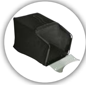
FABRIC CATCHER for 18" cut width lawnmowers

Light weight fabric catcher on a sturdy steel frame. Well vented for excellent catching performance. Will hold 1.2 bushels on 350ST machines.