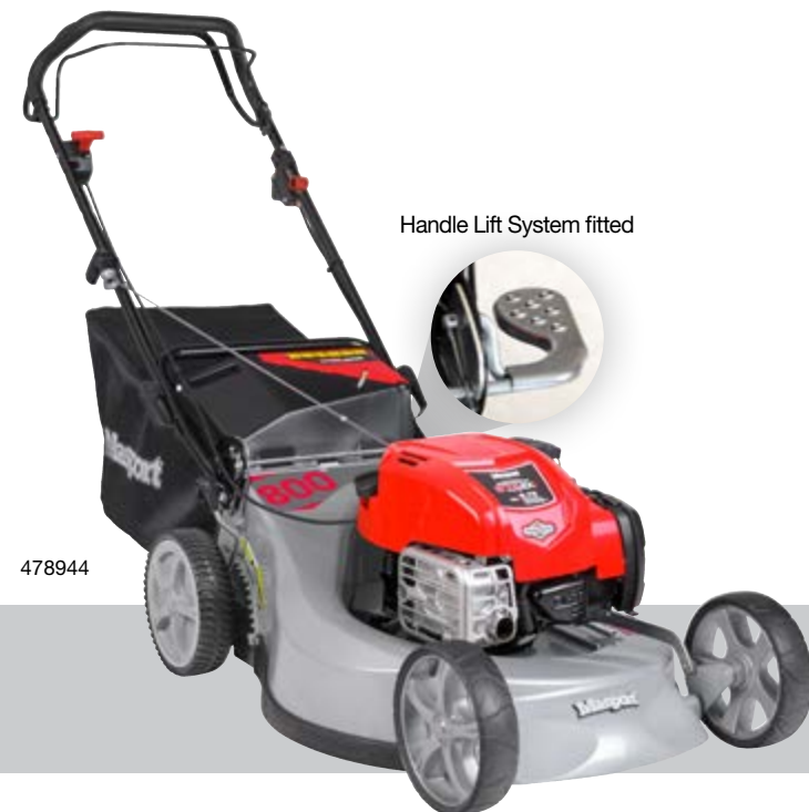
Handle Lift System fitted